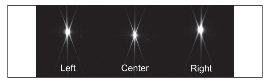
Figure 5. As the telescope's focus is adjusted, the middle spike of the diffraction pattern moves left and right of center of the "X" formed by the other two diffraction spikes. Adjust focus until the middle spike is exactly centered in the X; that's when precise focus has been achieved.

Although a PinPoint Mask could be used to focus for visual observing, it's generally not necessary. It is intended as a tool for astrophotography.