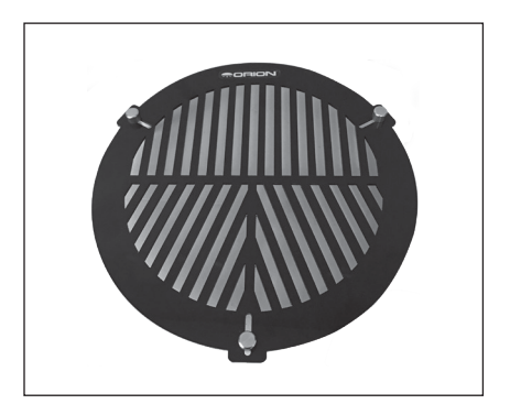
Figure 1. An Orion PinPoint Telescope Focusing Mask

when storing it and use care when handling and it will last indefinitely.