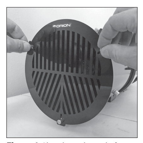
Figure 4. Place the mask over the front of the telescope, then slide the grip posts inward until they contact the telescope's front cell or dew shield before tightening the thumbscrews.

As you turn your telescope's focus knobs to move in and out of focus, you should see that center spike move to one side and the other of the X. Make fine adjustments of the focus until the center spike lands exactly in the center of the X; that is, it bisects the X. Then you're in focus!