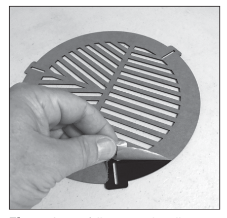
Figure 2. Carefully remove the adhesive backing paper from the mask.

Your PinPoint mask may come with a protective adhesive backing paper on one side. If you wish to remove it (you don't have to) just use a fingernail or knife tip to peel up a small portion at the edge, then slowly lift the rest off ( Figure 2 ). Be careful not to put undue pressure on the mask when removing the backing, so as not to crack the mask.