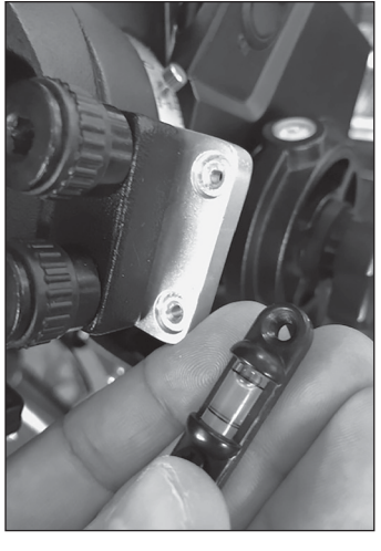
Figure 3. The bubble level has been removed. Note that the chrome colored backplate stays attached to the mount.