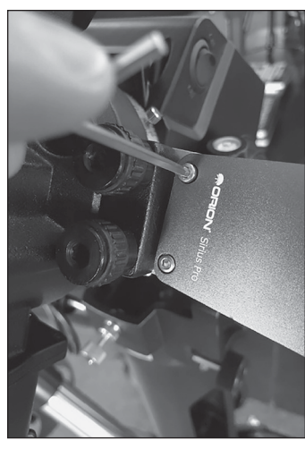
Figure 4. Install the P1 Sirius Pro plate using the socket head cap screws included in the adapter box.