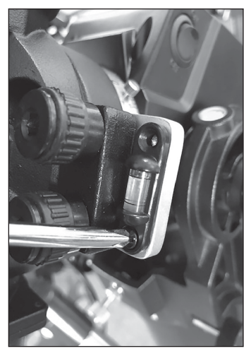
Figure 2. Remove the two black Philips screws to remove the bubble level.