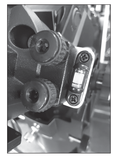
Figure 1. Locate the bubble level on the mount – you'll need a Philips screwdriver to remove the bubble level from the chrome colored backplate.

Installation of the P1 on a Sirius Pro mount is slightly different than some of the other mounts sold by Orion. The P1 adapter will attach where the bubble level currently sits, so first the bubble level itself must be removed. Refer to the pictures below for step by step instructions.