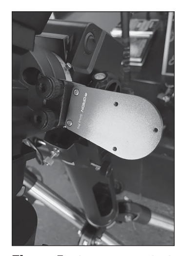
Figure 5. The P1 Sirius Pro back plate fully installed on the Sirius Pro mount