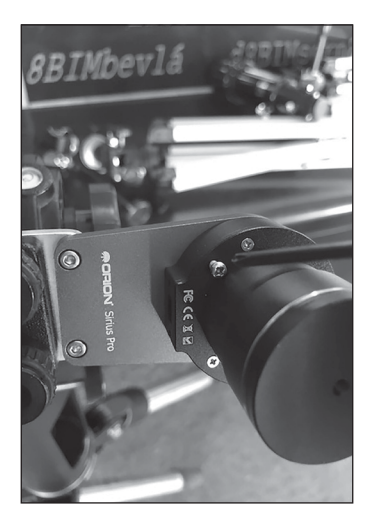
Figure 6. Attach the P1 to the backplate using the three long Philips screws included in the P1 camera box. Note the proper orientation of the connector port -- facing left (towards the mount). The three holes in the camera are through holes (no threads), and the screw threads will engage in the plate behind the camera.