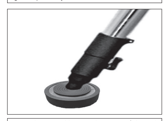
Fig. 2: Place tripod leg into the center of the pad.